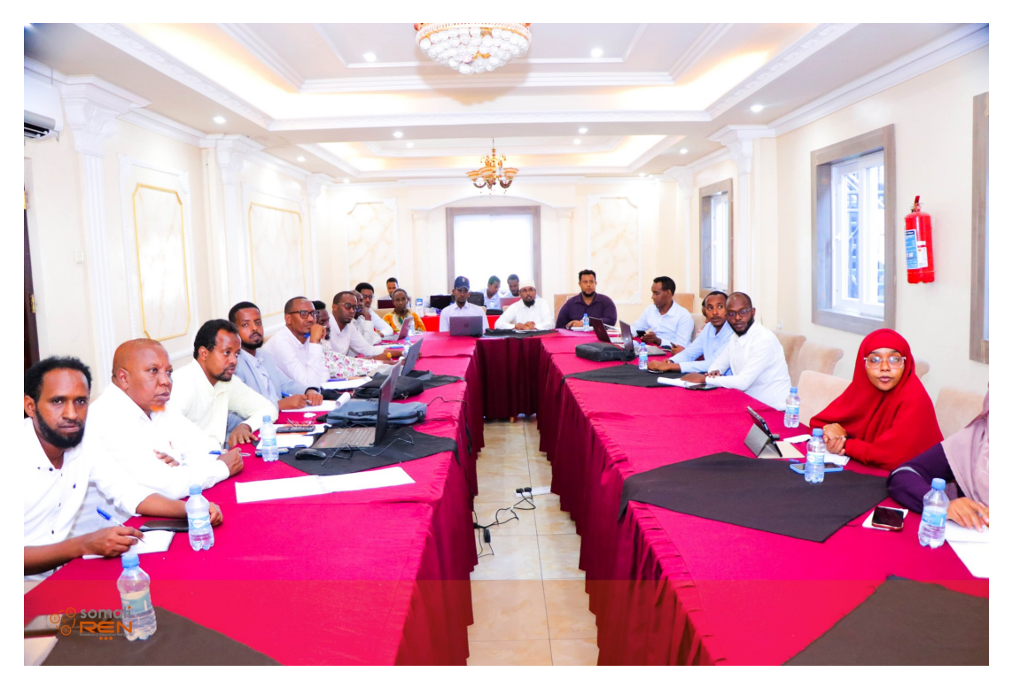
First Workshop and Conference Librarian Professionals. Feb 2023